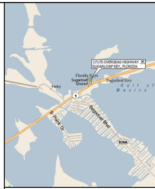
VICINITY MAP NORTH

PROJECT DESCRIPTION INSTALLATION OF A 100' STEALTH POLE FOR WIRELESS COMMUNICATIONS SERVICES APPLICANT KEYS WI-FI P.O. BOX 999 TAVERNIER, FLORIDA 33070 PROPERTY OWNER SUGARLOAF KEY VOLUNTEER FIRE DEPT. INC. 17175 OVERSEAS HIGHWAY SUGARLOAF KEY, FLORIDA 33042 ZONING SC-SUBURBAN COMMERCIAL FIRE PROTECTION FIRE PROTECTION NOT REQUIRED, STRUCTURE IS NOT FLAMMABLE PARKING PARKING FOR SERVICE TECHNICIANS WILL BE IN ACCESS EASEMENT TOWER FALL ZONE IN THE UNLIKELY EVENT OF A STRUCTURAL FAILURE OF THE TOWER, IT WILL FALL WITHIN THE LIMITS OF THE PARENT TRACT. PROPERTY INFORMATION MONROE COUNTY PARCEL #34662700117930000100 ADDRESS: 17175 OVERSEAS HIGHWAY SUGARLOAF KEY, FLORIDA 33042 TOTAL PROPERTY ACREAGE: 0.51 ACRES (22,000 SF) TRAFFIC STATEMENT EXPECTED NUMBER OF TRIPS PER CARRIER PER MONTH WILL BE 2 FOR EQUIPMENT MAINTENANCE. THIS PROJECT WILL NOT AFFECT OVERALL PERFORMANCE OF ADJACENT ROADWAY. STORMWATER STATEMENT TOTAL AMOUNT OF PROPOSED IMPERVIOUS AREA WILL BE XXXX SF ON 0.51 +/- ACRE PARENT TRACT. STORMWATER DETENTION AREA TO BE DETERMINED IF NECESSARY PER COUNTY WATER MANAGEMENT REQUIREMENTS